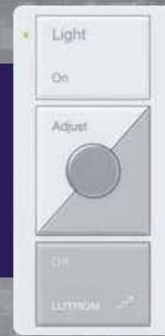
Pico™ wireless control

Innovative wireless controls that provide flexibility, convenience, and easy installation and set up.